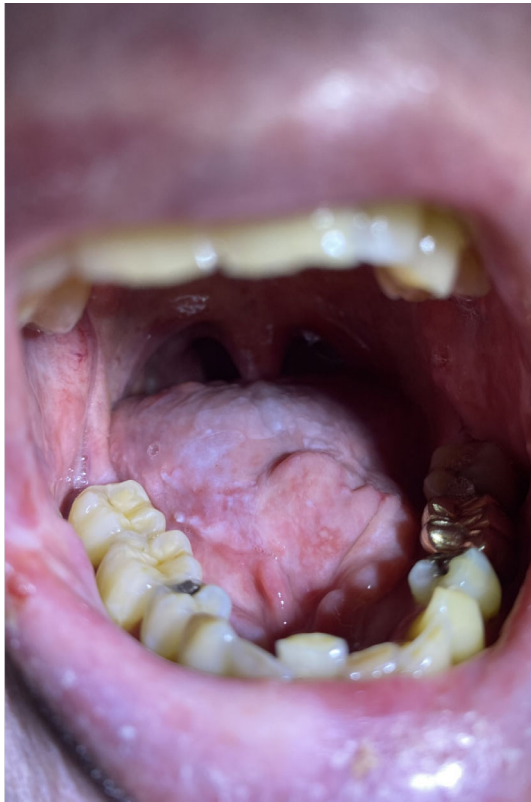
FIGURE 1 Photograph of patient 1's tongue lesion uploaded to the secure electronic health care portal for review by the head and neck surgeon [Color figure can be viewed at wileyonlinelibrary.com ]

The patient was counseled on the need for tissue biopsy of the concerning vocal cord lesion.