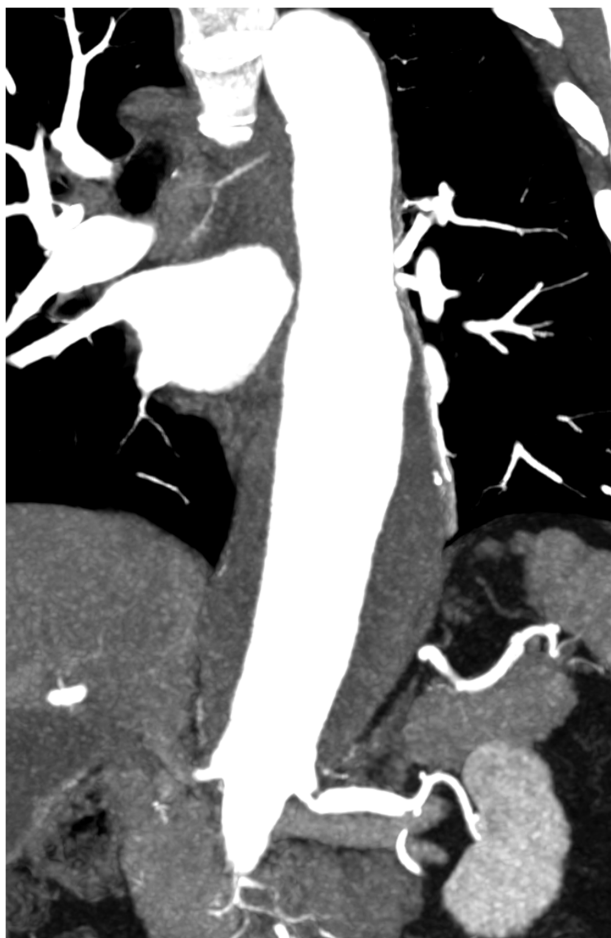
Fig. 1 Pre-operative computed tomography angiogram.

Cannulation of the SMA was performed with a 0.035 hydrophilic guide wire directed by the steerable sheath shaped into a bend of an approximately 180° turn. This was exchanged to a Rosen wire through a vertebral catheter. A 90 cm 7F Rabee sheath (Cook Medical, Bloomington, IN, USA) was advanced to the ostium of the SMA for protection of the covered stent. Subsequently, a 10 mm × 57 mm balloon-expandable covered stent,