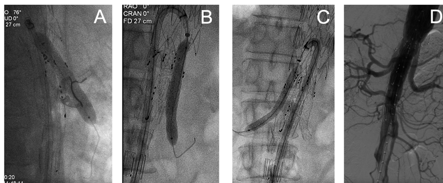
Fig. 2 The use of the steerable sheath for stent deployment into (A) the superior mesenteric artery, (B) the left renal artery and (C) the right renal artery. (D) Completion angiogram.