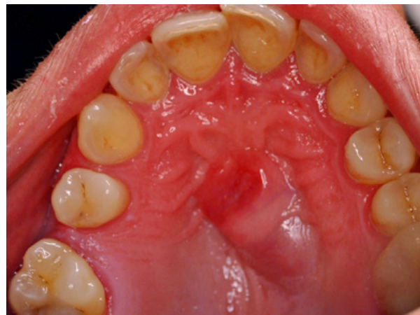
Fig. 1. Intraoral view shows an exophytic tumor on the hard palate (mirror image).

On physical examination, a firm, sessile based tumor of the submucosa of 2.0 x 1.5 cm in size was observed in the midline of the hard palate. The surface mucosa was intact except for an erythematous central area (Fig. 1).