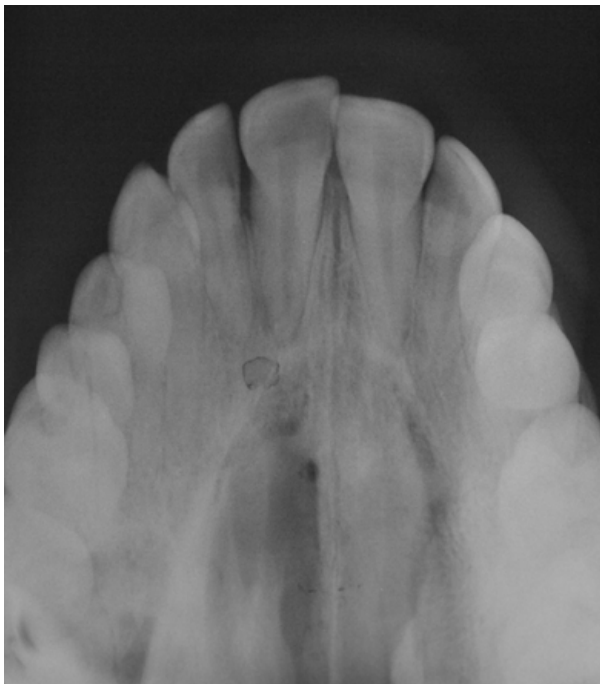
Fig. 2. Occlusal radiography showing a not well-defined and slightly more radiolucent area.