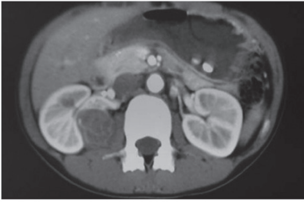
Figure 1. Computed tomography for the right renal hemangiopericytoma.