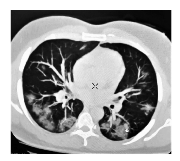
Fig. 1. High-resolution CT thorax of a 42-year-old male, doctor by profession without any comorbidities, showing progressive stage of GGO.

SARS-CoV-2 carriers (symptomatic or asymptomatic), combined IgM- IgG-ELISA may offer a better utility and sensitivity, compared to a either a IgM- or IgG-ELISA test alone. b. all symptomatic subjects or contacts should be assessed with rapid antibody testing first, if positive then RT-PCR should be done as the confirmatory test. c. all highly suspicious cases should undergo RT-PCR first, even if the rapid antibody tests are negative. d. If antibody test is negative initially, it should be re-tested after 7–10 days.