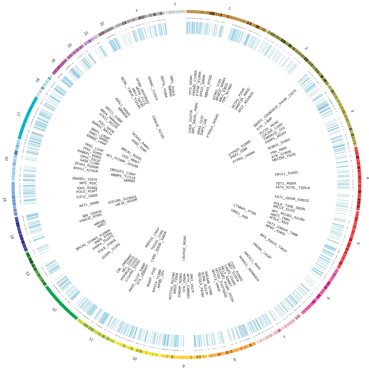
Figure 2. Circular diagram of mutations found in MPN. Chromosomes are illustrated in the outer perimeter. Grey dots show the ‘cancer exome’ regions of the NimbleGen panel, whereas the histograms show the captured (blue) and failed (red) target regions. MicroRNA or Gene Symbol with amino acidic change refers to the variants found in our cohort.

In addition, 8 genes ( SCRIB , MIR662 , BARD1 , TCF12 , FAT4 , DAP3 , POLG and NRAS ) appeared as recurrently mutated in the cohort, some of which ( SCRIB 7.9%, MIR662 7.4% and BARD1 5.3%) were more frequently mutated than previously identified, well-known mutational hotspots 18 (Table 4).