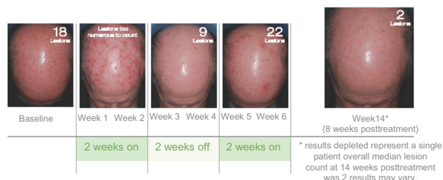
Figure 3 Characteristic patient response during a course of imiquimod therapy for actinic keratoses.

Studies have demonstrated a low incidence of new actinic keratotic lesions after treatment with imiquimod, due to its ability to induce immunologic memory. 41 This long-term clearance offers an advantage in terms of the cost of retreating areas of recurrence. By treating the field of cancerization, subclinical lesions are eradicated, thus eliminating the need to wait until these lesions are clinically visible and further progressed.