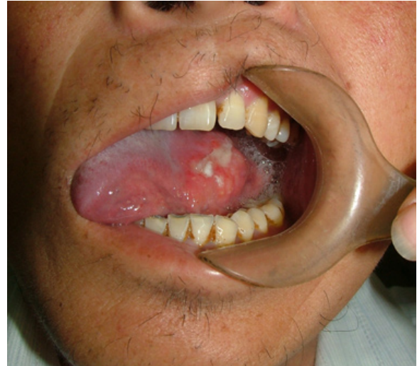
Fig 4. Preoperative clinical appearance of squamous cell carcinoma in the left tongue.

46 patients with tongue carcinoma underwent simultaneous reconstruction after hemiglossectomy. 34 patients underwent hemiglossectomy reconstruction with FRF flap; 12 patients underwent hemiglossectomy reconstruction with free thin ALT flap (Fig. 4-6). In the thin ALT flap group, all reconstruction succeeded. There was vascular crisis in 1 case, and secondary treatment was taken to rescue the flap (occurrence rate 8.3%). In the FRF flap group, 33 flaps survived, and there was necrosis in 1 flap (success rate 97.1%). There was vascular crisis in 3 cases (occurs rate 8.8%) and secondary treatment was needed. In the thin ALT flap group, the donor sites were all closed directly without complication. Meanwhile, in the FRF flap group, the donor sites were closed with grafted skin. In 4 cases, a partial grafted skin loss was observed and the donor sites healed for long time under local wound care. 9 cases suffered from