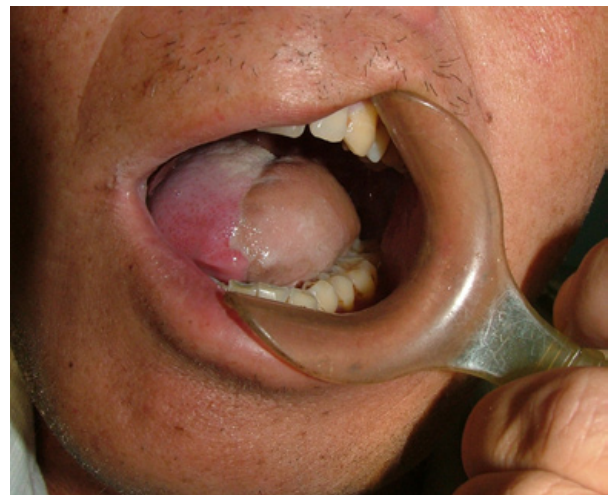
Fig 5. Postoperative appearance of the thin ALT flap 3 months after the tongue reconstruction.