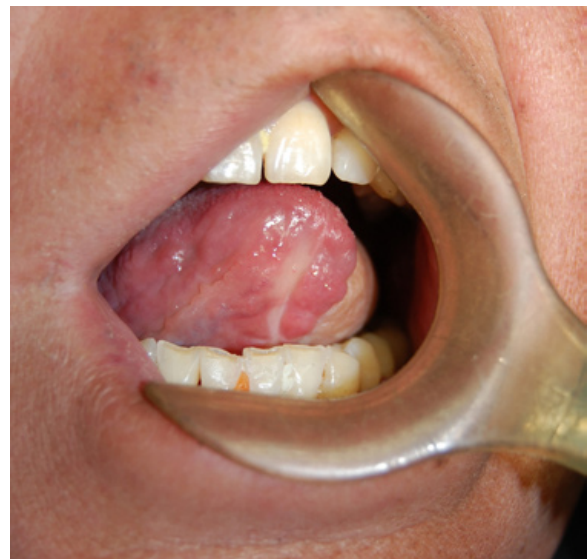
Fig 6. The protrusive movement of tongue after reconstruction with the thin ALT flap.