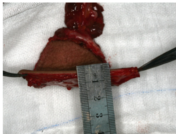
Fig 2. The thinning of ALT flap was completed, and it can be safely thinned to 4 mm thick.