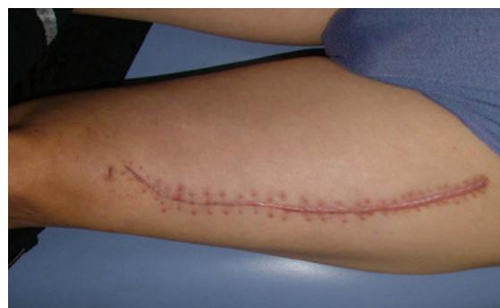
Fig 3. The donor-site scar of the left thigh 3 months after surgery.