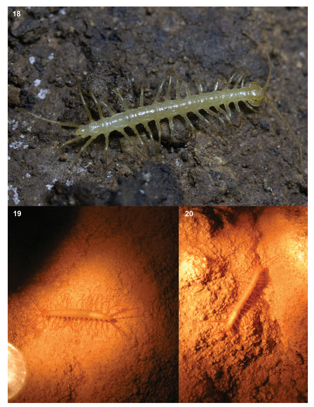
Figures 18–20. Lithobius specimens from Dinaric caves 18 living Lithobius cf. matulici specimen of ca. 25 mm length from the Vjetrenica Cave (Bosnia and Herzegovina) 19–20 Lithobius sp. under water in the Dobuki Do Cave (Montenegro).