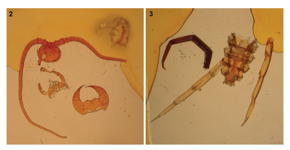
Figures 2,3. Holotype of Lithobius matulici Verhoeff, 1899 on slides from the Museum für Naturkunde, Berlin 2 slide No. 266 3 slide No. 267.

any clearing agents before slide mounting, since the muscles are well visible inside (Fig. 3). All the other parts cleared, probably via potassium hydroxide, because their muscles were dissolved.