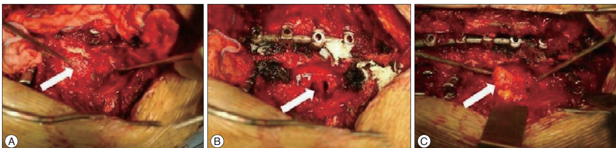
Fig. 5. A : Intraoperative photograph showing meningocele (arrow). B : Defect formed after excision of the cyst (arrow). C : Obliteration of the defect with the subcutaneous fat graft (arrow).