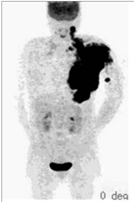
Fig. 3. Post-operative PET scan of the patient showing increased uptake in the region of the left breast suspicious for breast carcinoma.

NF1 is an autosomal-dominant disorder with a prevalence of 1 in 3000 6,15) . It is also associated with various other malignancies such as peripheral nerve sheath tumors, optic gliomas, and leukemias. The diagnostic features of NF1 include the presence of café-au-lait macules, subcutaneous nodules, freckling in the axillary or inguinal regions, optic gliomas, and Lisch nodules. In our case, café-au-lait macules, axillary freckling, and subcutaneous nodules were present. In a case series, Nanson et al. 10) reported that about 70% of intrathoracic meningoceles were associated with NF1 and scoliosis, referring to the cluster of these disorders as a three-fold syndrome. In our case as well, the patient was known to have NF1 and presented with a giant intrathoracic meningocele and significant scoliosis. Controversies regarding the treatment of intrathoracic meningocele are prevalent among scholars. Miles et al. 8) advocated conservative treatment