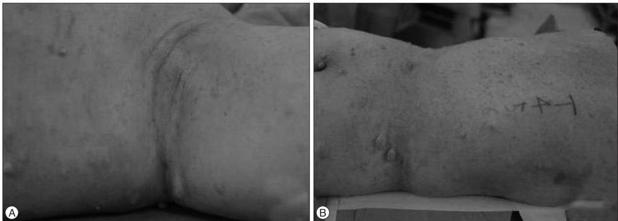
Fig. 1. (A) Photographs of the patient showing axillary freckling and (B) multiple subcutaneous nodules distributed all over the body.