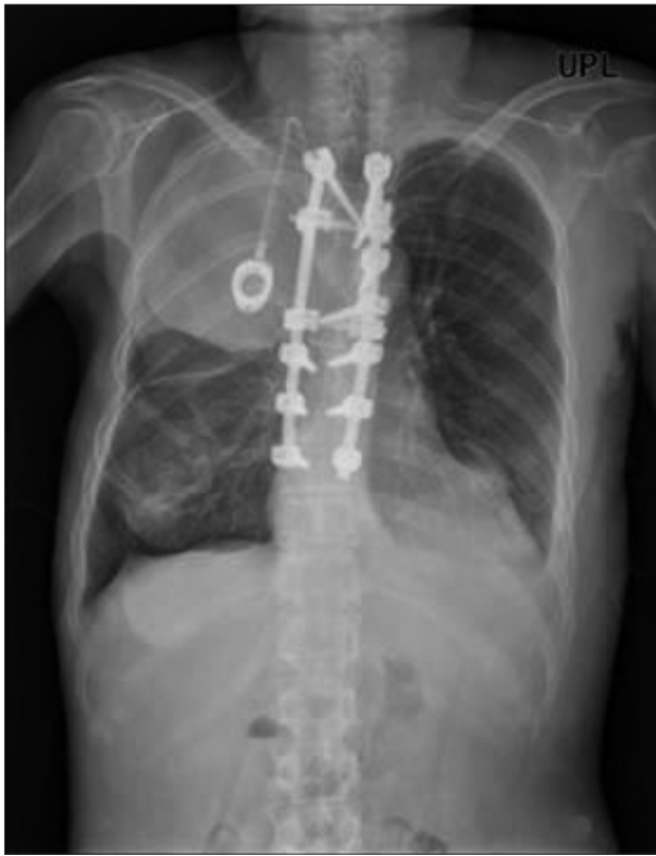
Fig. 6. Follow-up chest X-ray showing recurrence of meningocele in the upper lobe of the right lung with satisfactory correction of the kyphoscoliosis.

for meningoceles until they become symptomatic, provided the patients have benign pathology or are surgically difficult cases. Alternatively, some authors 1,9) have recommended early surgical intervention for everyone because they observed progressive enlargement of the intrathoracic meningoceles in two-thirds of the cases. However, surgical intervention for intrathoracic meningoceles associated with NF1 is not free from complications including respiratory failure, post-operative CSF leakage, empyema, infection, and recurrence. We were aware of these possible complications preoperatively but chose to perform surgical excision of the meningocele and correction of the spinal deformity due to the presence of acute respiratory distress and neurological deficits. Intervention halted progression of the scoliotic curve and relieved the dyspnea.