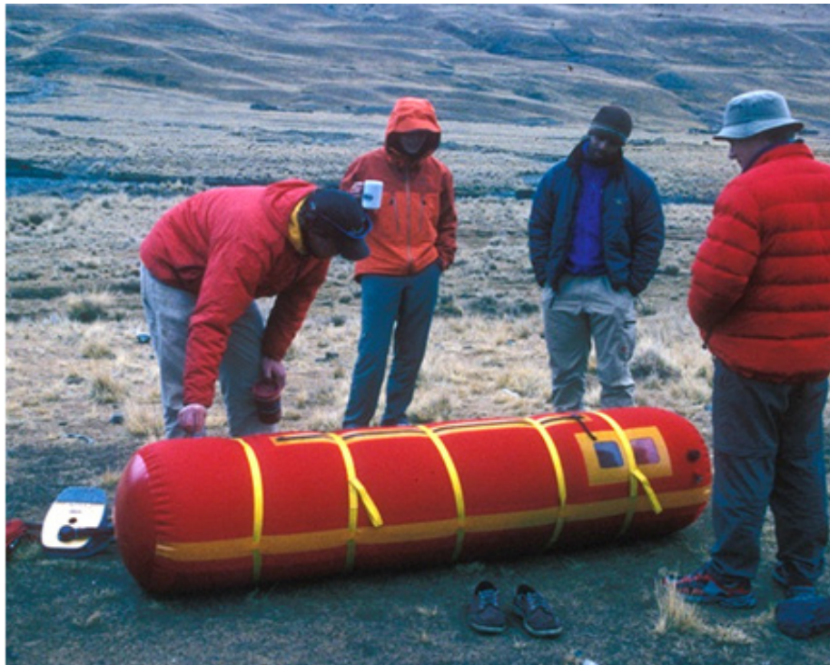
Figure 4. Portable hyperbaric chamber.

The exact processes leading to high-altitude cerebral edema are unknown although the edema is probably extracellular, due to blood-brain barrier leakage (vasogenic edema), rather than intracellular, due to cellular swelling (cytotoxic edema).