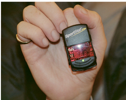
Figure 3. Pulse oximeter.

Pulse oximeters have a pair of small diodes