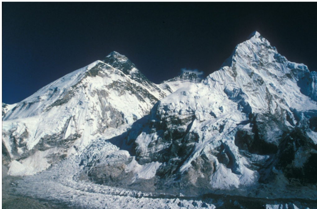
Figure 1. Nuptse on the right, Lhotse in the center, and Mount Everest to the left rear with the Khumbu ice-fall and glacier in the foreground.

physiologic responses to high-altitude hypoxia to provide a context for understanding high-altitude illnesses; the second is to discuss specific risk factors, prevention, and treatment options for acute mountain sickness (AMS) and the potentially fatal syndromes of high altitude pulmonary and cerebral edema so that physicians and health care professionals can appropriately advise travelers ascending to high altitude. The review is organized by specific topics to allow the reader to quickly identify areas of interest.