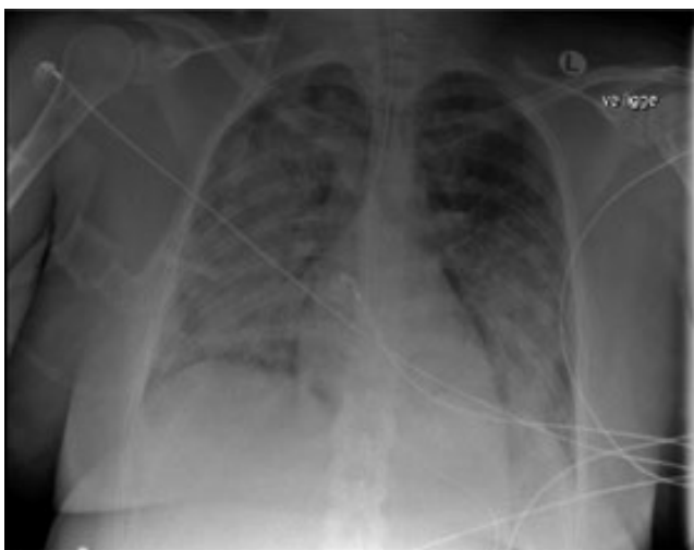
FIGURE 1 Chest X-ray showing bilateral infiltrates

The patient received blood products originating from eight different blood donors. All donors were tested for anti-HLA class-I and anti-HLA class-II antibodies, for granulocyte- and lymphocyte-reacting antibodies with a combination of direct and indirect flow cytometric granulocyte/lymphocyte immunofluorescence tests (Flow-D-GIFT, Flow-GIFT, Flow-LIFT), granulocyte antibodies with a granulocyte agglutination test (GAT) and the LABScreen Multi assay. Antibody specificity was confirmed with monoclonal