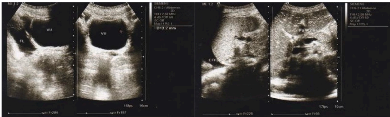
Fig. 2. Abdominal ultrasonography showed acalculous cholecystitis, right cholestasis, ascites on 5th day.

surgical morbidity due to the presence of DF can be avoided [13]. Initial hematological laboratory result which is inconjunct with abdominal ultrasonography findings can help physicians to consider this diagnosis [14]. The involvement of cholecystitis may lead to gallbladder wall thickening (GBWT). This sign appears due to increased capillary permeability. The hallmarks of ultrasonography findings on AAC diagnosis in pediatrics rely on diagnostic criteria as follows: (1) increment of gallbladder wall thickness ( \geq 3.5 mm), (2) Pericholecystic fluid, (3) Appearance of mucosal membrane sludge, (4) Gall bladder distension. The thickness of the gallbladder above 3 mm is significantly associated with more severe dengue cases, whereas the thickness greater than 5 mm is associated with the risk of threatening hypovolemic shock [15]. Computerized tomography (CT) is considered as accurate as ultrasonography in diagnosing AAC. However, its radiological exposure restricts its use in the pediatric age and CT is not always available, more expensive and cannot be performed bedside [13]. Ultrasonography findings and laboratory parameters could not identify the causative agent of AAC. Bacterial AAC usually manifests with leukocytosis and increased inflammatory markers. Acute acalculous cholecystitis due to viruses has better prognosis than bacterial and improved with a conservative therapy, such as adequate intravenous fluid therapy, analgesic, and antibiotics [16].