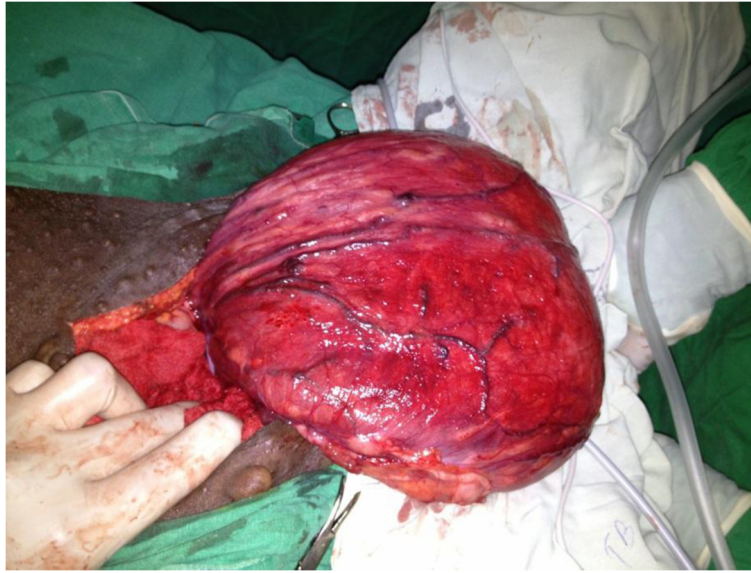
Figure 4 Large neuropathic bladder found during surgery.

fossa. Her US scan of the abdomen revealed mild right sided hydronephrosis. She underwent sigmoidoscopy which was normal up to the proximal sigmoid colon. Barium enema (Figure 3) showed herniation of the rectum through a defect in the pelvic floor.