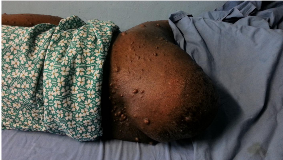
Figure 1 Large R/sided buttock hernia.

undergone excision of neurofibromas adjacent to right knee joint and over the right buttock 7 years back. She did not have a family history of neurofibromatosis. She did not give a past history of hypertension or other comorbidities. On examination, she had multiple neurofibromas all over the body and one plexiform neurofibroma over left knee area. There was a non reducible lump of 25× 20 cm size over the right buttock. It had an expansile cough impulse and was non tender on palpation. Digital rectal examination was normal. Therefore, a clinical diagnosis of a secondary perineal hernia was made.