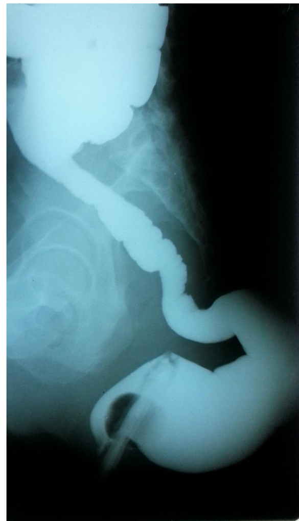
Figure 3 Barium enema showing the herniated rectum.