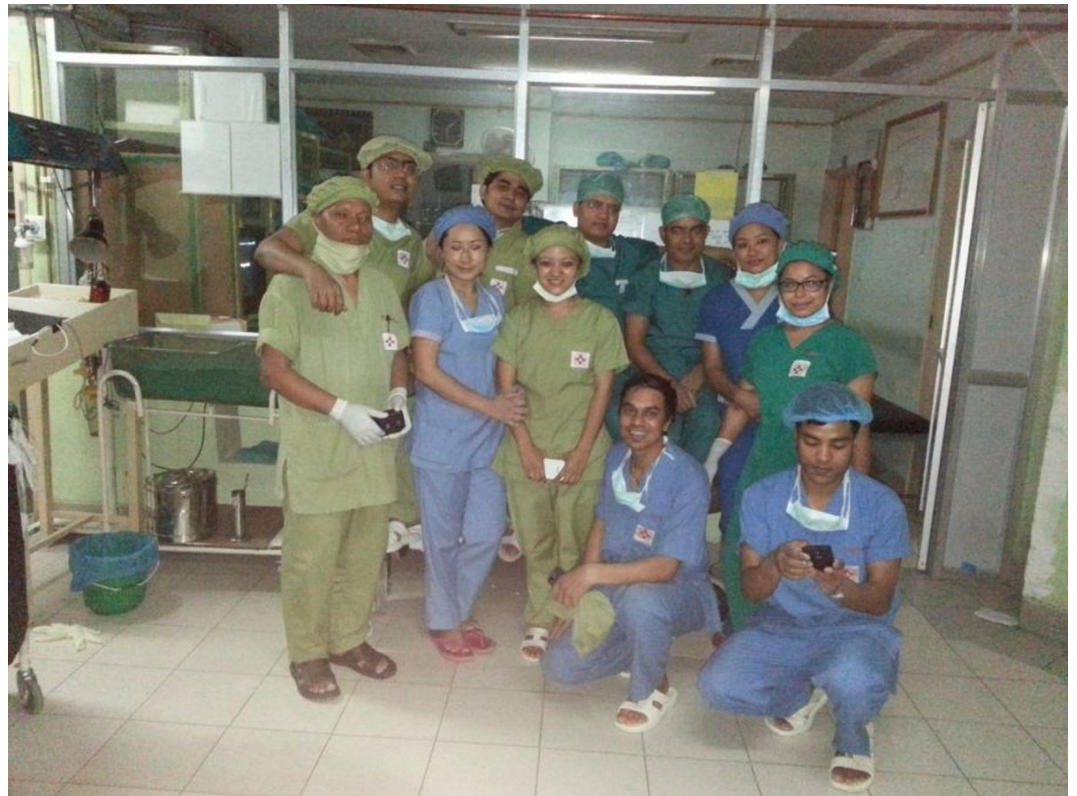
FIGURE 6: A combined force of local and guest surgical team members

The injuries treated included that of the upper limbs, lower limbs, and spine. Almost all the major bones of the body were injured in different patients and were fixed accordingly. Out of nine patients with open injuries; five patients had a Gustilo Anderson Grade IIIA injury, three patients had a Grade IIIB injury, and one patient had a Grade II injury. Out of these nine patients, eight patients had lower limb injuries whereas only one patient had an upper limb injury. All these open injuries were managed by debridement and external fixation. We tried our best to avoid any amputation, but four patients had badly mangled extremities that could not be saved in spite of our best efforts. Out of these four patients; two patients had below the knee amputation, one patient had above the knee amputation, and one patient had a below the elbow amputation (Table 1).