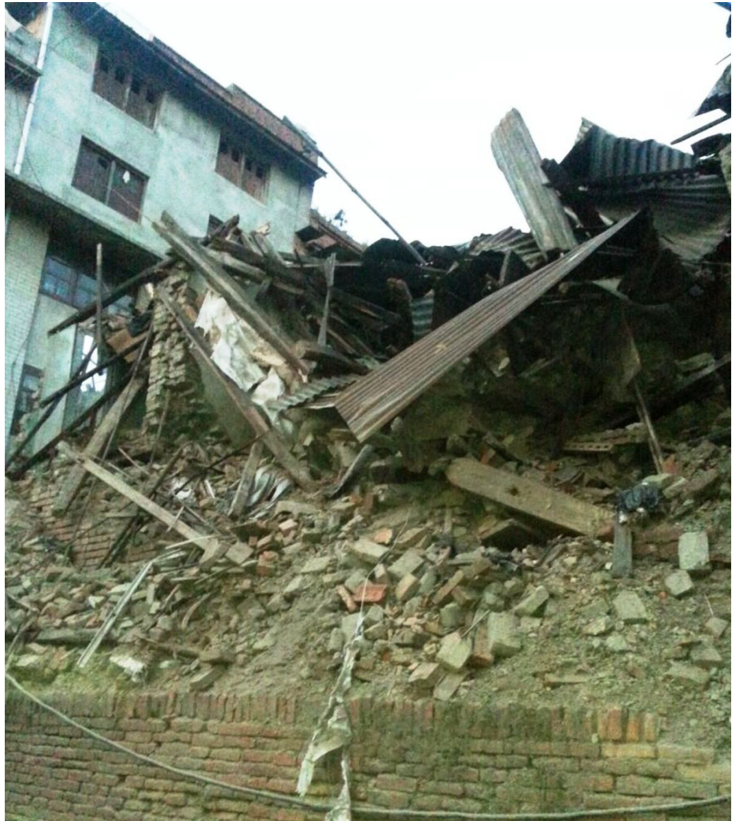
FIGURE 2: Severely damaged and collapsed buildings mainly responsible for injuries.

There were more than 8,000 deaths and more than 14,000 people were injured. This earthquake triggered an avalanche on Mount Everest killing at least 19 mountaineers also. Thousands of people were made homeless across many districts of the country. Many archaeological monuments and centuries-old buildings were destroyed (Figures 2-3). Many buildings were ready to collapse due to earthquake-induced cracks, and these buildings were supported by logs of wood temporarily.