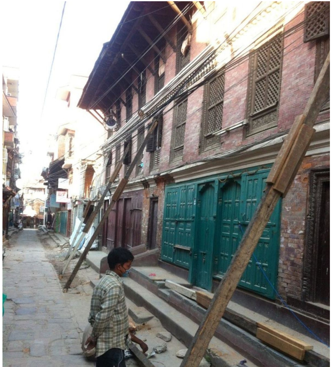
FIGURE 3: Damaged archeological monuments

Earthquakes usually inflict more injuries and morbidity than mortality and these injuries are predominantly musculoskeletal in nature [1]. Initial management at the time of an earthquake is often hampered by the destruction of basic infrastructures and hospital facilities due to shocks [2]. Due to the sudden, unexpected, and disproportionate increase in the number of trauma patients as well as limited surgical and anesthetic support, often early definite orthopaedic management is usually not possible. The role of orthopaedic surgeons during rescue missions in such situations is, therefore, important [3]. We report the injury pattern and profile of musculoskeletal injuries managed by our team soon after the 2015 Nepal earthquake, within a short span of three days.