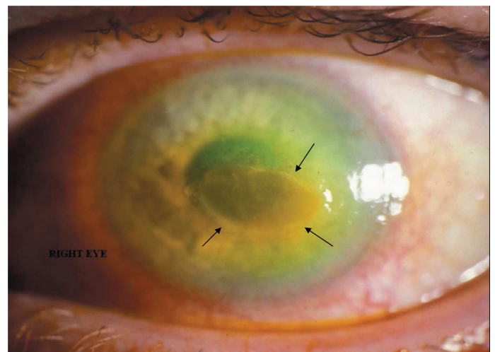
Figure 1. Enhanced fluorescein uptake and central corneal ulceration (black arrows) in the right eye.

All blood investigations, including serum ACE, were normal. Chest x-ray and T2 weighted cranial magnetic resonance imaging (MRI) without contrast, performed at the time of trigeminal nerve involvement, were normal. In view of the above and in the absence of other acute neurological involvement, lumbar puncture was not performed. Repeat of the positive skin biopsy was not considered by the dermatologists at the time of ocular involvement, since the patient, despite 25 years of treatment with systemic