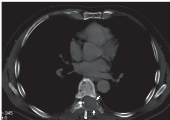
Figure 2. Pretreatment computed tomography revealed a metastatic bone tumor in the ninth thoracic vertebral arch.

kinase inhibitors and mammalian target of rapamycin inhibitors, all of which have shown significant activity against RCC with metastases, no treatment has been established for sarcomatoid RCC and few studies have analyzed this histological variant. Furthermore, reports discussing the effects of vascular endothelial growth factor-targeted agents are limited. Certain authors have reported the efficacy of tyrosine kinase inhibitors for sarcomatoid RCC only in patients with a limited amount of sarcomatoid components (<20%) in the primary tumor (5). In addition, a recent study from the MD Anderson Cancer Center illustrated that sunitinib shows no benefit in RCC patients with >50% sarcomatoid components (6).