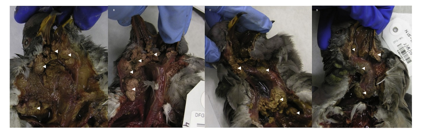
Fig. 2. Examples of caseonecrotic lesions (white arrowheads) in the oral cavity and upper digestive tracts of band-tailed pigeons ( Patagioenas fasciata monolis ) collected during an avian trichomonosis mortality event in California, U.S.A., between November 2014 and June 2015. Birds collected from Contra Costa County (A), Marin County (B), and Monterey County (D) in January 2015 and Placer County (E) in February 2015.