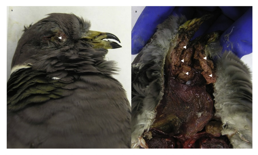
Fig. 3. Caseonecrotic lesions (white arrowheads) in the right eye socket (A) and oral cavity (B) of a band-tailed pigeon ( Patagioenas fasciata monolis ) collected during an avian trichomonosis mortality event in Santa Clara County, California, U.S.A., in January 2015.