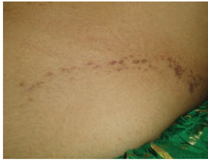
Figure 3. Gravid abdomen showing linear pigmented macules and papules.