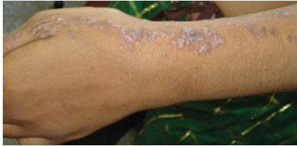
Figure 1. Typical violaceous papules over thumb and forearm in a linear distribution.

lichen planus, a need to follow up the patient in current and subsequent pregnancies becomes essential to find a positive correlation between pregnancy and lichen planus and to establish whether pregnancy itself could have triggered lichen planus.