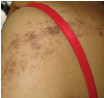
Figure 2. Pigmented papules and macules over shoulder.