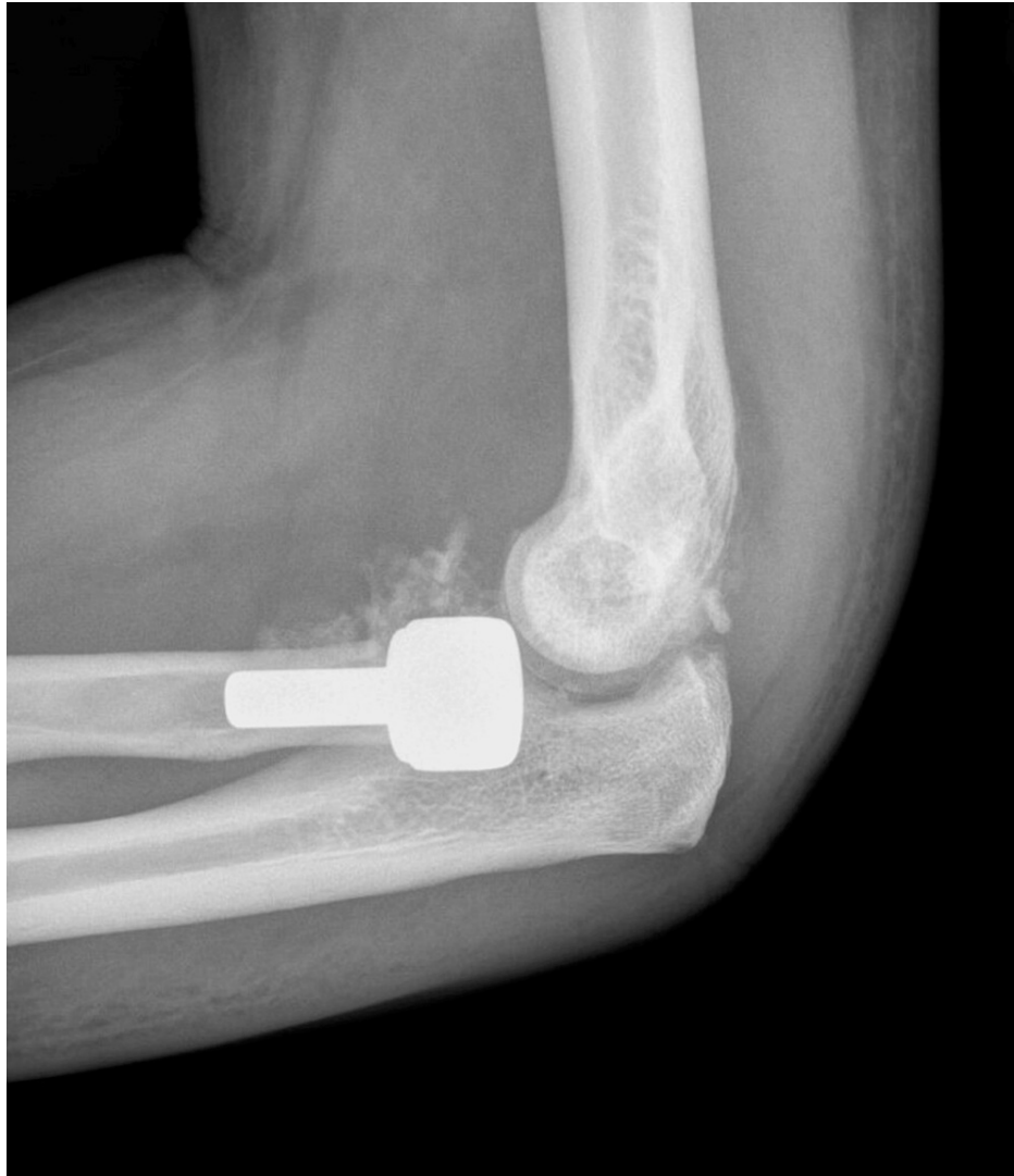
FIGURE 2: Lateral elbow radiograph demonstrating posterior subluxation of the radial head prosthesis 4 weeks after the index TT procedure.