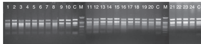
Fig. 1. Agarose gel electrophoresis of the RNA isolated from plant samples. Lanes 1, 2, 3 & 4 for T. urartu ; 5, 6, 7 & 8 for Ae. speltoides ; 9, 10, 11 & 12 for Ae. squarrosa ; 13, 14, 15 & 16 for 'Chinese Spring'; 17, 18, 19 & 20 for 'Chaupon'; 21, 22, 23 & 24 for 2BS.2RL. C, control RNA (3 µg). M, 100 bp size marker.

genome (R; S. cereale ) in the form of chromosome translocations [6,7,8]. Near-isolines (NILs) were developed by backcross introgression to form BC 3 F 3:4 ('Coker 797' *4/'Hamlet') [9] and differed in the presence or absence of the long arm of rye chromosome 2 (2RL) derived from the diploid rye 'Chaupon' [9,10]. We used a NIL carrying 2RL (hereafter, 2BS.2RL) as a material of wheat–rye translocation lines [5]. Details of the sequence preparation for probe design were described in Lee et al. [5]. Sequence data sets used for probe design were as follows: A genome sequence, T. monococcum (A genome progenitor of hexaploid wheat, which belongs to the A genome lineage); B, Ae. speltoides (B genome progenitor, which belongs to the B genome lineage); D, Ae. squarrosa & Ae. tauschii (close relative of subgenome D of hexaploid wheat and D genome progenitor, which belong to the D genome lineage); ABD, T. aestivum ; R, S. cereale .