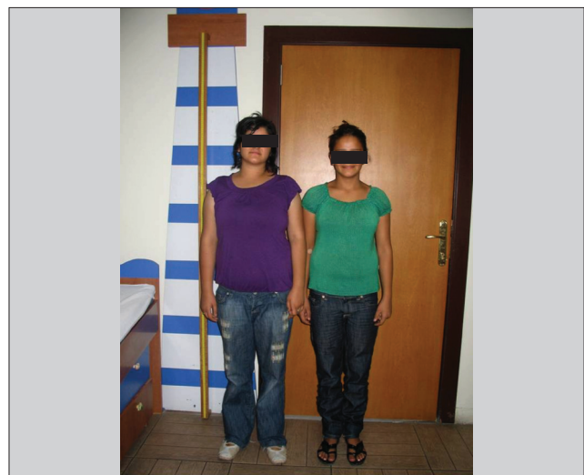
Figure 2. b) Patients with GH-releasing hormone receptor ( GHRHR ) mutation: after treatment