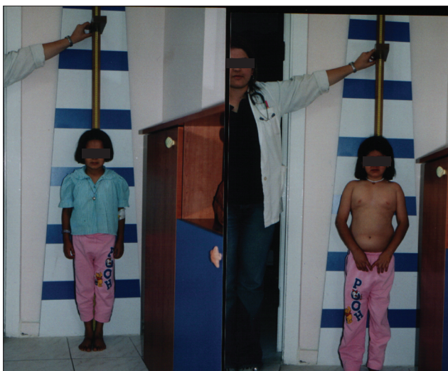
Figure 2. a) Two sister with GH-releasing hormone receptor ( GHRHR ) gene mutation: before treatment