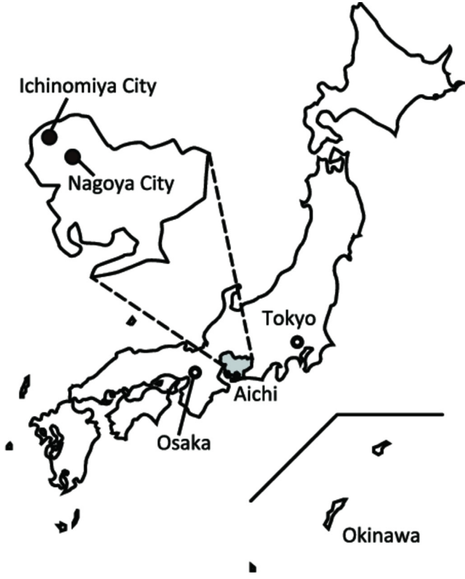
Figure 1 Study areas covered by the JECS-A.

was known as an area involved in textile production but is now a regional commercial and residential area with a mixed economy of manufacturing and agriculture. Both areas are relatively urban and widely known in the automobile and ceramics industries.