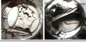
Figure 3. Observation of test membrane degradation in SBF over time.

degradation rate of filler, a mixture of high- and low-molecular weight hyaluronic acid formulations is used. 19 In addition, the capability for the material to remain in the body for a long duration (1–2 years) is one reason for its high demand. 20