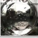
Figure 3. Observation of test membrane degradation in SBF over time.

degradation rate of filler, a mixture of high- and low-molecular weight hyaluronic acid formulations is used. 19 In addition, the capability for the material to remain in the body for a long duration (1–2 years) is one reason for its high demand. 20