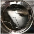
Figure 3. Observation of test membrane degradation in SBF over time.

degradation rate of filler, a mixture of high- and low-molecular weight hyaluronic acid formulations is used. 19 In addition, the capability for the material to remain in the body for a long duration (1–2 years) is one reason for its high demand. 20