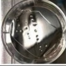
Figure 3. Observation of test membrane degradation in SBF over time.

degradation rate of filler, a mixture of high- and low-molecular weight hyaluronic acid formulations is used. 19 In addition, the capability for the material to remain in the body for a long duration (1–2 years) is one reason for its high demand. 20