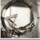
Figure 3. Observation of test membrane degradation in SBF over time.

degradation rate of filler, a mixture of high- and low-molecular weight hyaluronic acid formulations is used. 19 In addition, the capability for the material to remain in the body for a long duration (1–2 years) is one reason for its high demand. 20