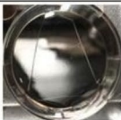
Figure 3. Observation of test membrane degradation in SBF over time.

degradation rate of filler, a mixture of high- and low-molecular weight hyaluronic acid formulations is used. 19 In addition, the capability for the material to remain in the body for a long duration (1–2 years) is one reason for its high demand. 20