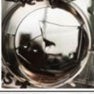
Figure 3. Observation of test membrane degradation in SBF over time.

degradation rate of filler, a mixture of high- and low-molecular weight hyaluronic acid formulations is used. 19 In addition, the capability for the material to remain in the body for a long duration (1–2 years) is one reason for its high demand. 20