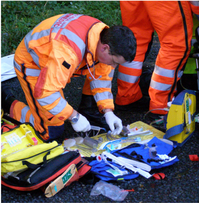
Figure 2 Use of the PHEA checklist (video of checklist in use will be displayed).