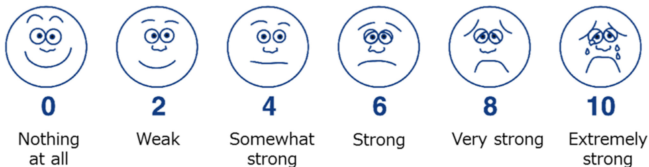
Figure 1 Face scale rate of perceived exertion.