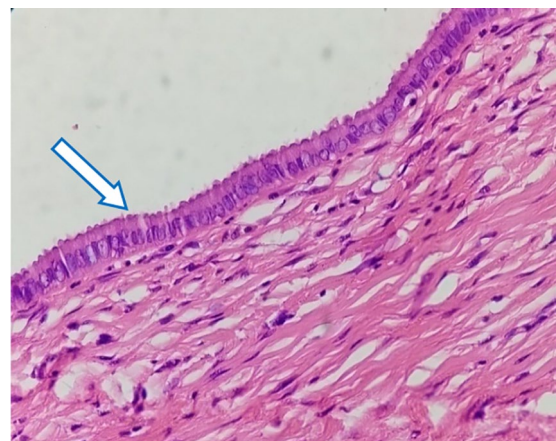
Figure 4. Nabothian cyst; inner cyst wall lined by single layer of ciliated low columnar epithelium (arrow) [H&E; ×400 magnification].