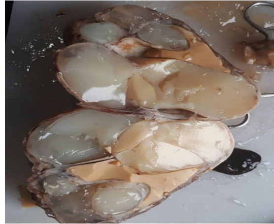
Figure 2. Cut section of mass revealed multiloculated, cystic spaces of varying size filled with mucinous material.

examination revealed a second-degree cervical prolapse with a mass coming out of introitus. Mass was firm to soft in consistency and slightly reducible. Uterus was parous size, mobile, firm, mildly tender, and the fornices were free. Initial differential diagnosis was uterovaginal prolapse and cervical fibroid. Tumors markers such as, cancer antigen 125, cancer antigen 19-9 and carcinoembryonic antigen were within normal limits. Transvaginal ultrasonography demonstrated a multicystic cervical mass of size 9.5 cm × 8.0 cm arising from the posterior lip of cervix that was protruding through the vaginal canal. The differential diagnosis made after transvaginal ultrasonography was nabothian cyst and cervical leiomyoma with multicystic degeneration causing uterine prolapse. The uncertainty of diagnosis still existed after imaging hence; laparoscopic biopsy was performed before definitive surgery to confirm malignancy. Benign lesion (nabothian cyst) was confirmed on biopsy. Thus, excision of the mass was planned. Per operative finding was a polypoid mass arising from the posterior lip of cervix. After excision of mass, prolapse became first degree. The cystic mass was sent for HPE. The patient was informed and counseled about the possibility of requirement of further surgical intervention if the first degree uterine prolapse progresses, and affects her quality of life.