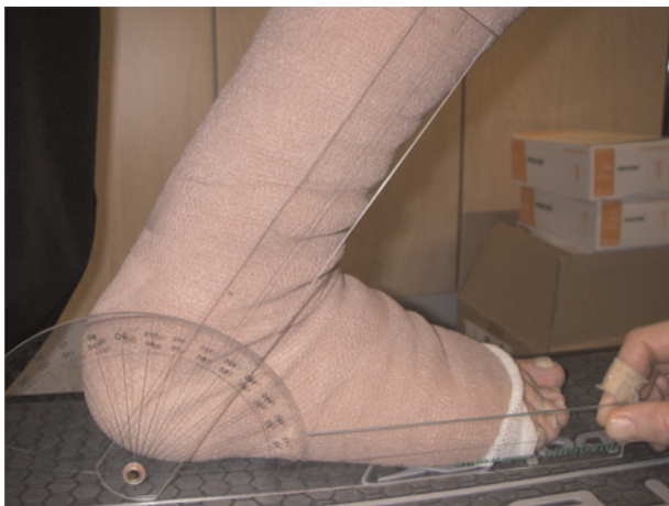
Figure 2 Measuring loaded ankle dorsiflexion with a Goniometer

Oxygen consumption, \text{VO}_2 ( \text{l minute}^{-1} ) was assessed after six minutes, at steady state, while the subject was walking on a treadmill (Cardio Rehab-Hill 3175, Cardionics Försäljning AB) with and without compression bandaging at a speed as close as possible to the self-selected walking speed in the corridor (Figure 2). Metamax II (Serial nos.