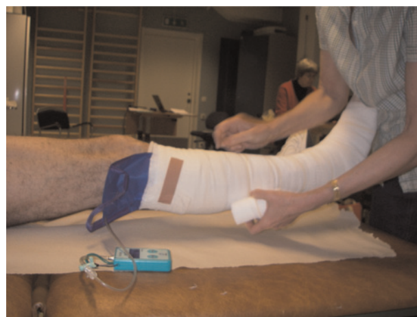
Figure 1 Measuring sub-bandage pressure using the Kikuhime pressure transducer (Biomedical Systems Engineering). The pressure transducer probe is placed inside a blue sheet positioned under the bandage to make it possible to slide the probe underneath the bandage from the ankle to the knee measuring sub-bandage pressure at three points: the lateral malleolus, 1.5 cm below caput fibulae and at the knee

The International Classification of Functioning, Disability and Health (ICF) was used as a conceptual model. 10 The following components of ICF were included: 'body functions and structures', 'activities' and 'personal factors'.