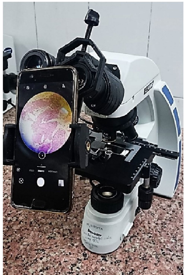
Fig. 1 The technique of taking smartphone images of cases with an adaptor

To avoid interobserver variability in the interpretation of the cases, the images were diagnosed by the same pathologist.