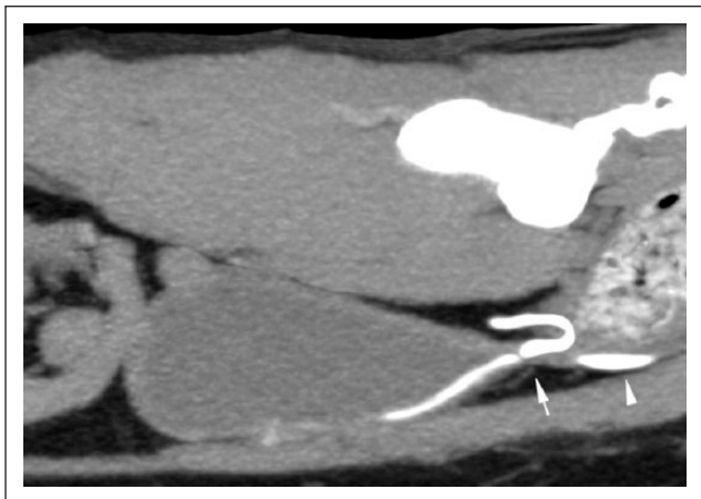
Figure 3 Postintravenous contrast sagittal computed tomographic image of a torted urinary bladder showing contrast pooling (arrowhead) caudal to the site of torsion (arrow)

ureters had a reduction in diameter and demonstrated evidence of peristalsis (Table 3). There was normal ureteral insertion into the trigone. There was some residual narrowing of the trigonal lumen at the site of the previous torsion. The cat was assessed as having near complete resolution of structural urinary tract changes as a result of surgery so no subsequent deterioration in renal function due to obstruction was anticipated. The cat was deemed to have stage 2 chronic kidney disease according to the IRIS guidelines, and was discharged with advice to feed a proprietary renal diet and seek repeat assessment of renal parameters every 3 months.