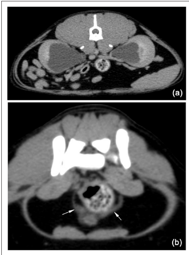
Figure 1 (a) Transverse computed tomographic (CT) images showing bilateral hydronephrosis in a cat with urinary tract obstruction due to bladder torsion. (b) Transverse CT images showing bilateral hydroureter (arrows) in a cat with urinary tract obstruction due to bladder torsion

performed with 4-0 glyconate (Monosyn; B Braun). The abdomen was closed routinely.