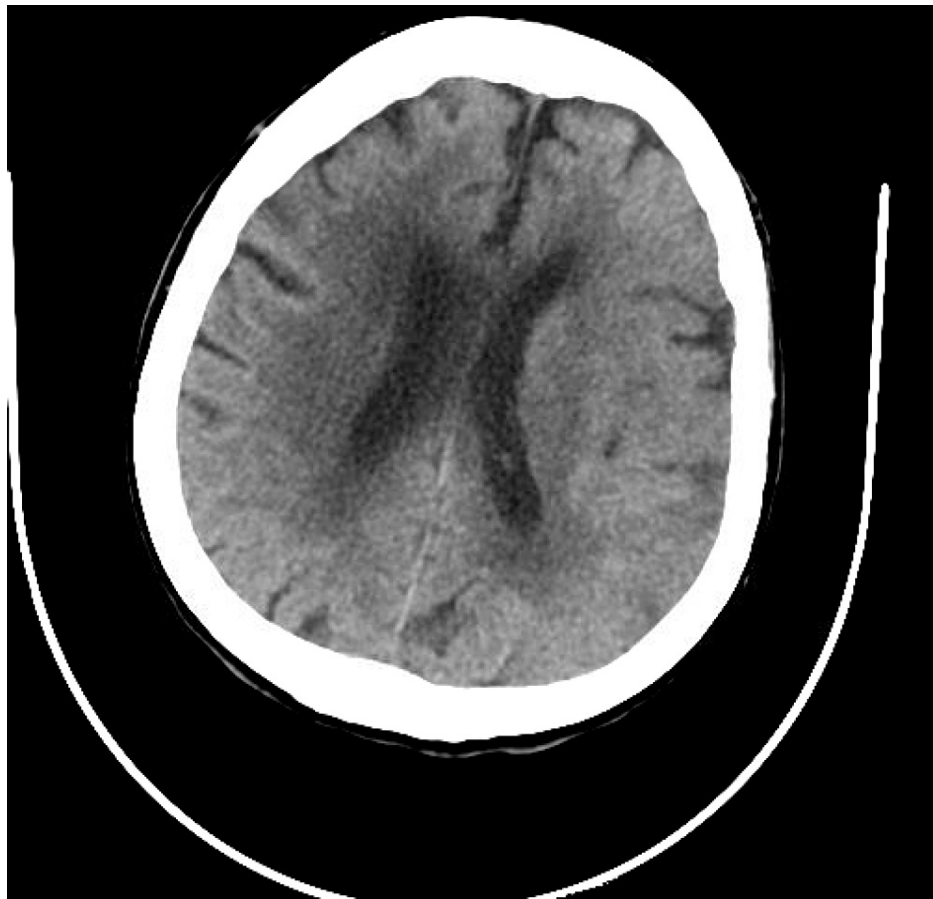
FIGURE 1: CT scan of the head negative for intracranial bleed or acute infarct.

Still, a CT angiogram showed complete occlusion of the M1 branch of the left middle cerebral artery, as shown in Figure 2.