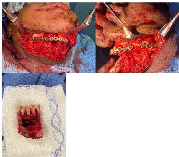
Figure 2. Intraoperative resection and repair of mandibular ossifying fibroma with pathologic fracture. (A) View of right segmental mandibulectomy with reconstruction using titanium reconstruction plate. (B) View of open reduction internal fixation of left mandibular angle fracture with titanium plate. (C) Resected ossifying fibroma.

third-fourth decade of life with a high predilection for females [7, 8]. The classic manifestation is a painless firm swelling of the jaw [9]. On imaging, it may appear most commonly as radio-opaque (49.2%) followed by mixed radio-opaque-radiolucent (34.9%) and radiolucent lesions (15.9%). Most lesions are unilocular (84.1%) [10]. The neoplasm is potentially aggressive; when left untreated, the dimensions can expand and cause disfigurement. This case presentation of an ossifying fibroma is rare based on the incidental diagnosis following a mandibular fracture in a 20-year-old male patient.