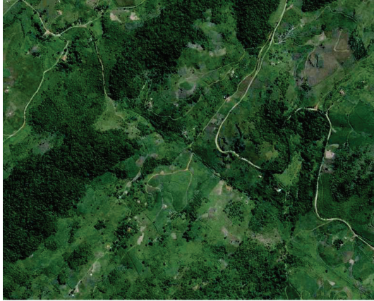
FIGURE 1: The Amarají landscape Pernambuco, Brazil, 2009, scale = 1 : 24,000.

the principal ACL vector in areas of São Paulo, Rio de Janeiro, and Minas Gerais [1, 11, 12]. Various factors have been identified as key in this domiciliation process, including climatic factors (annual and seasonal temperature and precipitation), vegetation type, and elevation, as well as socioeconomic conditions that may influence risk of transmission to humans [20, 21]. Finally, Lutzomyia whitmani ranks among the most important ACL vectors in Brazil [22] and has been found to be abundant in Atlantic Forest areas in Pernambuco since at least the 1990s [4, 16]. This species has been found to be infected naturally with Leishmania (Viannia) braziliensis in this region, forming a key element in the zoonotic transmission cycle of this pathogen [23, 24].