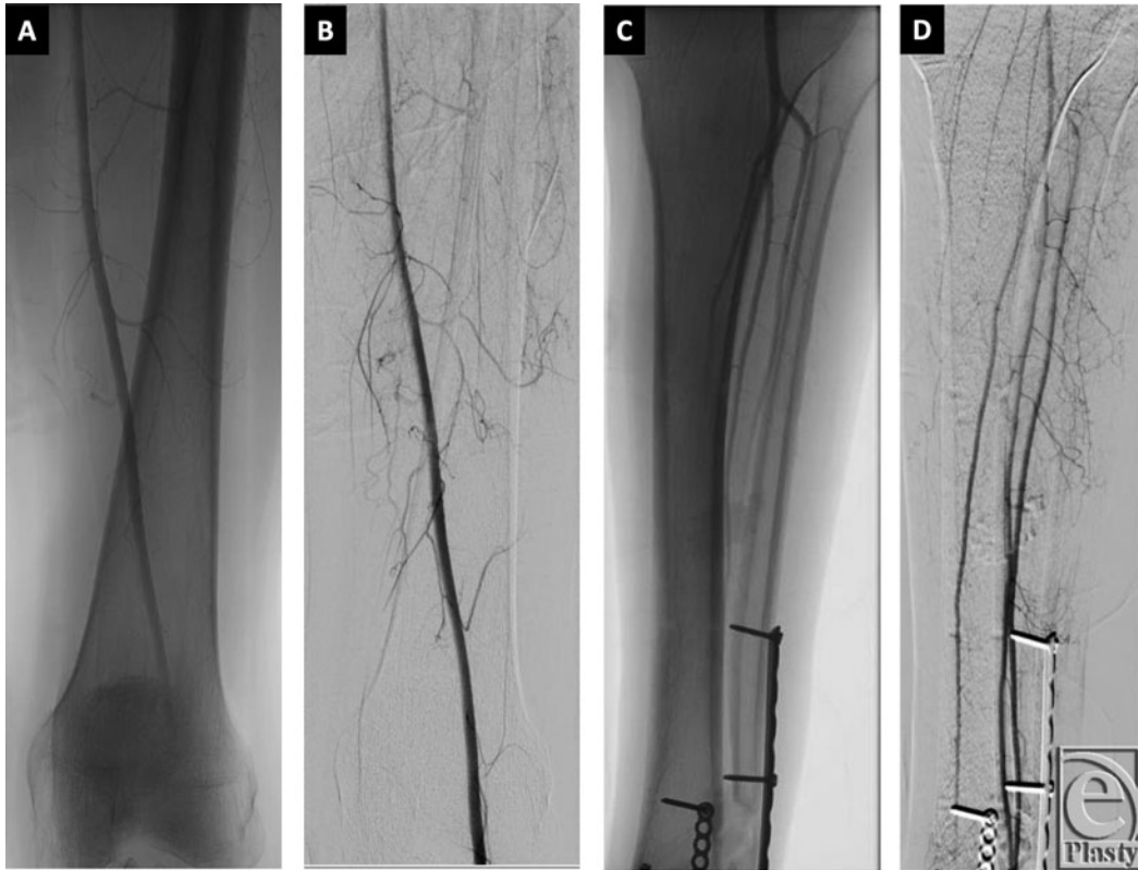
Figure 2. Arteriogram views of the supracondylar region (a, b) and the distal lower extremity (c, d) showing the widely patent common femoral, superficial femoral, and popliteal arteries. There is 3-vessel runoff to the foot via the widely patent anterior tibial, posterior tibial, and peroneal arteries.

and new antibiotic bead placement, interval intravenous antibiotics, followed by a free vascularized MFC bone flap to the distal tibial defect.