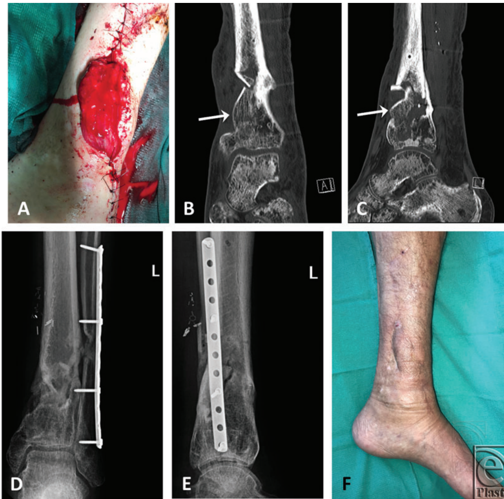
Figure 4. Immediate postoperative view of the chimeric myo-osseous MFC flap (a), AP (b), and lateral (c) computed tomographic scans of the MFC flap (arrow) at 3 months postoperatively, AP (d) and lateral (e) plain radiographs of the flap at 9 months postoperatively showing good bone healing, and a final photograph of the healed flap at 9 months postoperatively (f). MFC indicates medial femoral condyle; AP, anteroposterior.