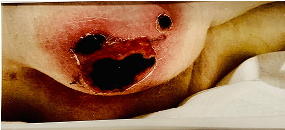
FIGURE 2: Right buttock skin necrosis, which shows three dry gangrenous ulcers of different sizes

He also had skin necrosis on the right buttock (Figure 2). The rest of his physical examination was unremarkable.