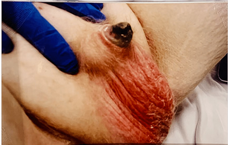
FIGURE 1: Preoperative appearance of penile dry gangrene and necrosis

He also had skin necrosis on the right buttock (Figure 2). The rest of his physical examination was unremarkable.