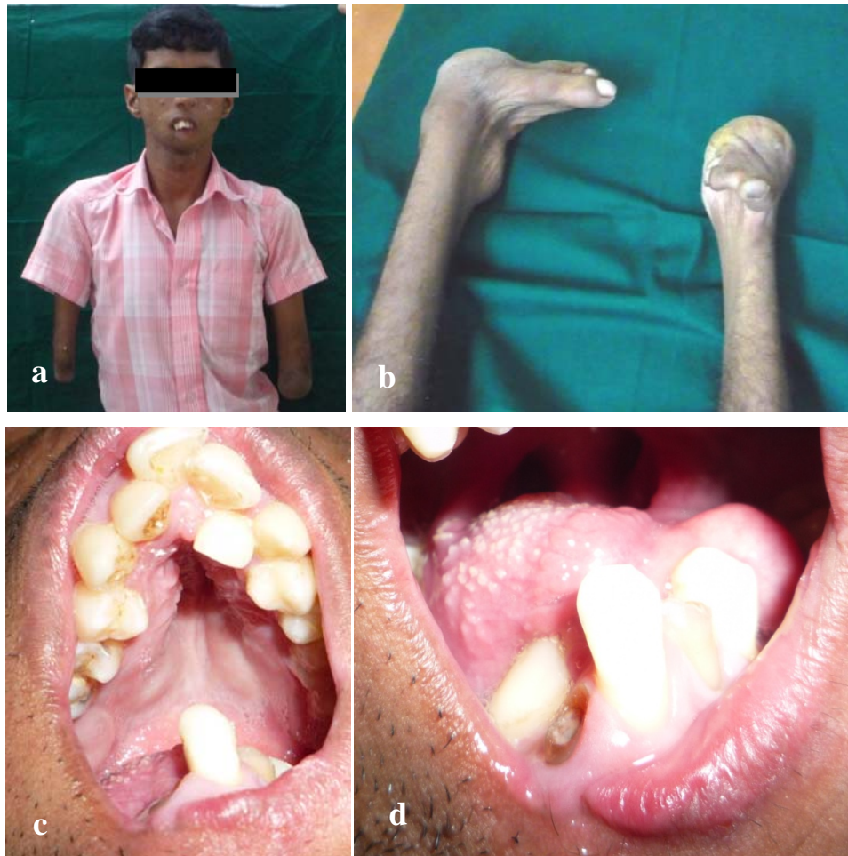
Figure 1. Clinical photograph of the patient showing peromelia of upper limbs (a); hypodactylia of lower limbs (b); constricted maxillary arch and fusion of the cutaneous part of the lower lip to the alveolar mucosa (c); clinical photograph showing hypoplastic tongue (d).

On extraoral examination, the patient exhibited peromelia of upper and lower limbs (Figure 1a,b), microstomia, protruded upper anterior teeth, retruded chin, incompetent lips and fusion of the lower alveolar mucosa with the cutaneous part of the lower lip. Intraoral examination revealed constricted maxillary and mandibular arches, absence of lower labial sulcus due to the fusion of lower lip to the alveolar mucosa (Figure 1c), hypoglossia (Figure 1d), hypodontia and root stumps in relation to the teeth #36, #43 and #46. The orthopantomograph revealed thinning of both the condylar heads, asymmetry between the right and left mandibular bodies and increased gonial angle (Figure 2a). Lateral cephalogram revealed