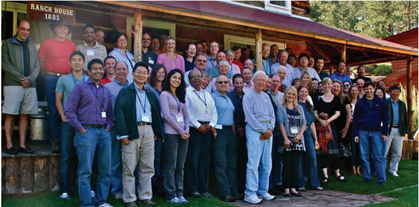
Figure 7: Grover attendees 2011. Taken in front of the ranch house where science and life are discussed.

established scientists. It has also been an inspiration for new scientists. It holds the memories of friends departed and the promise of new friends and colleagues, as evident in the 2011 photograph (Fig. 7).