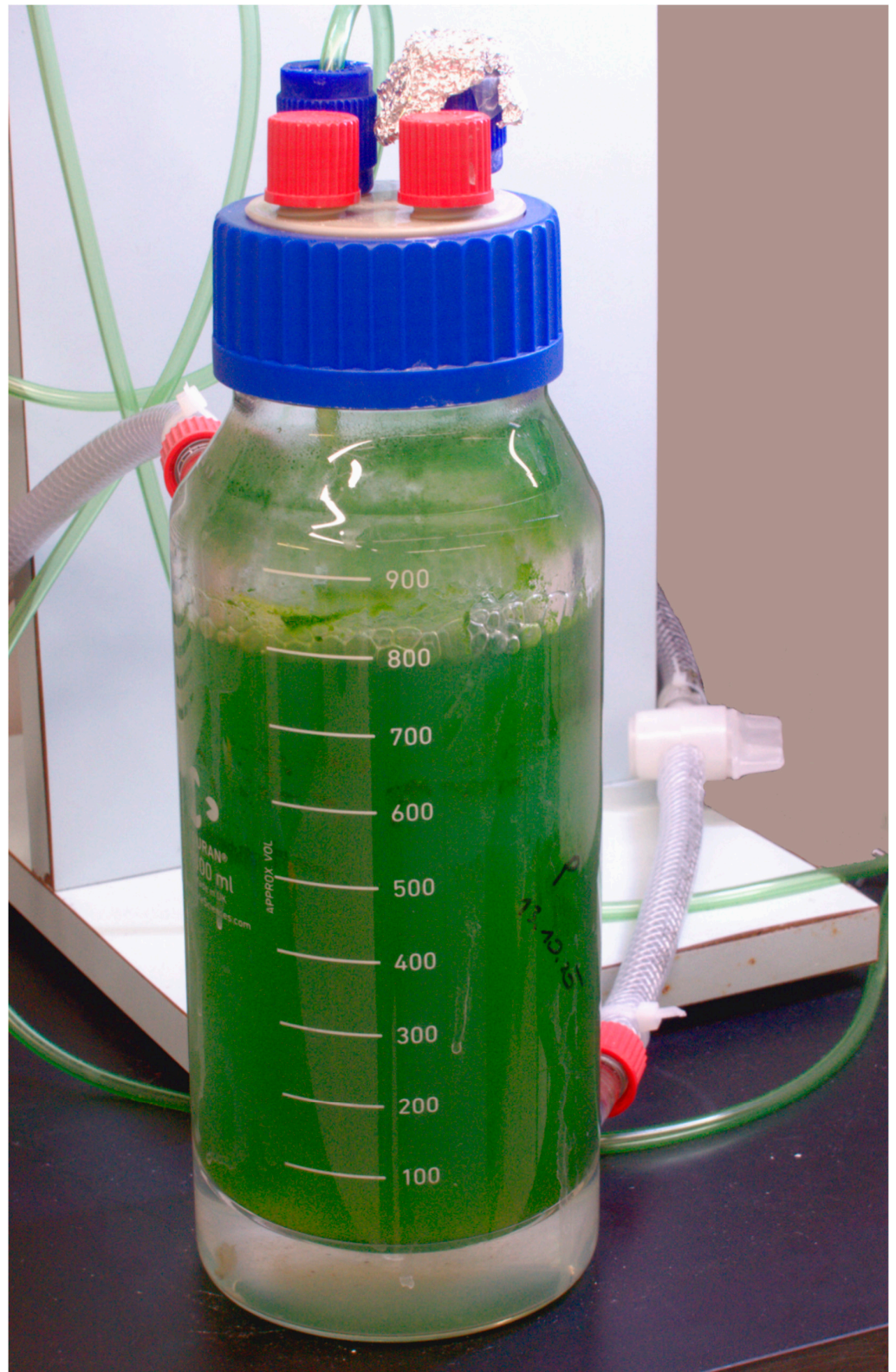
Figure 3. Culture of Arthrospira platensis in a bubble column type bioreactor. Slight foam formation and cell growth on the vessel walls were experienced.