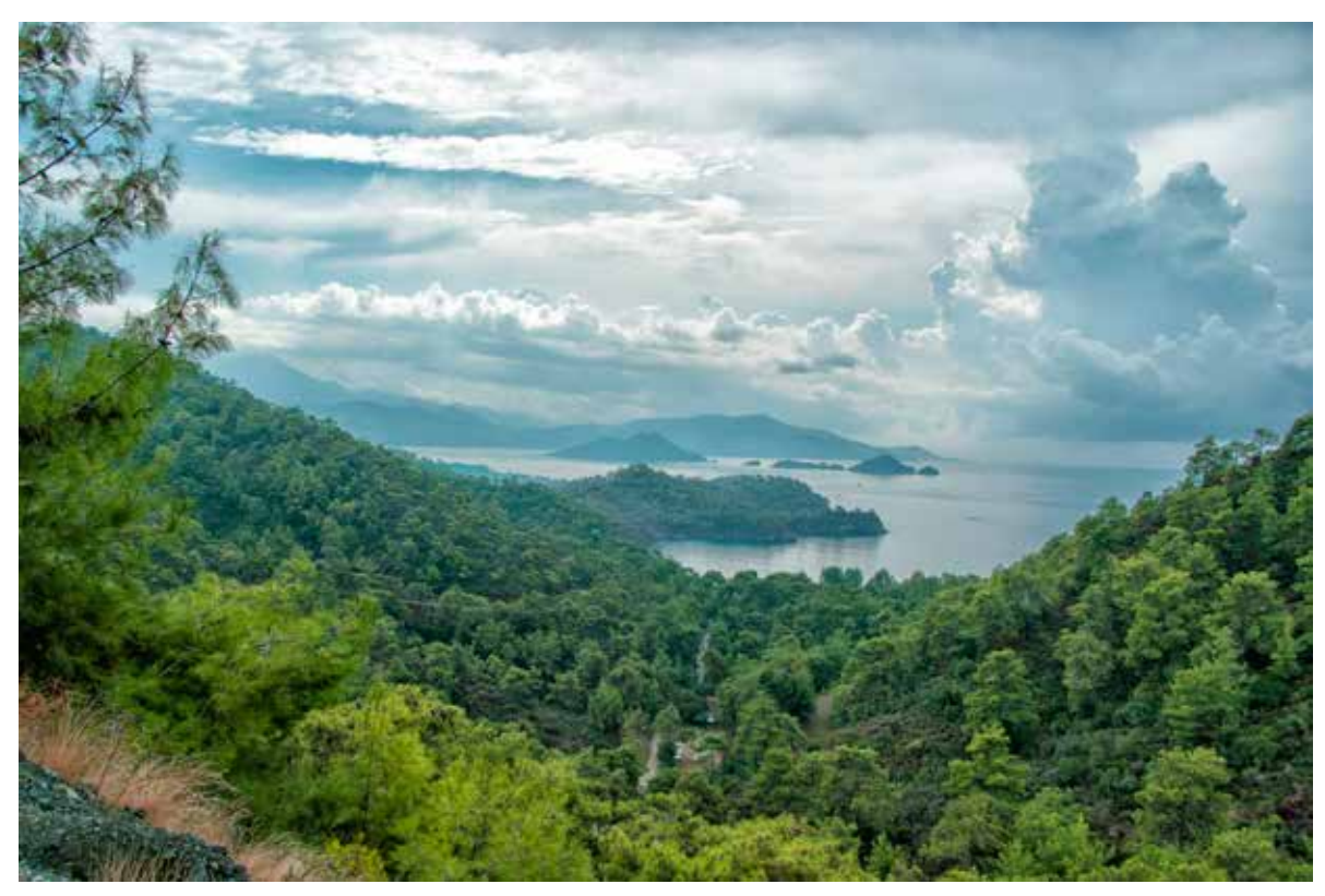
Ayla Bağ, from EFSAD's collections.