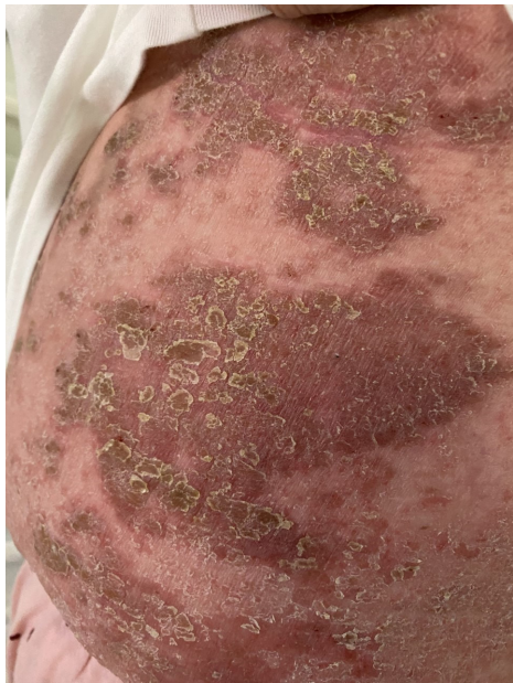
Figure 1 Erythematous skin rash on the abdomen and left lower chest

auscultation. The patient continued to have temperature spikes >38^{\circ}\text{C} .