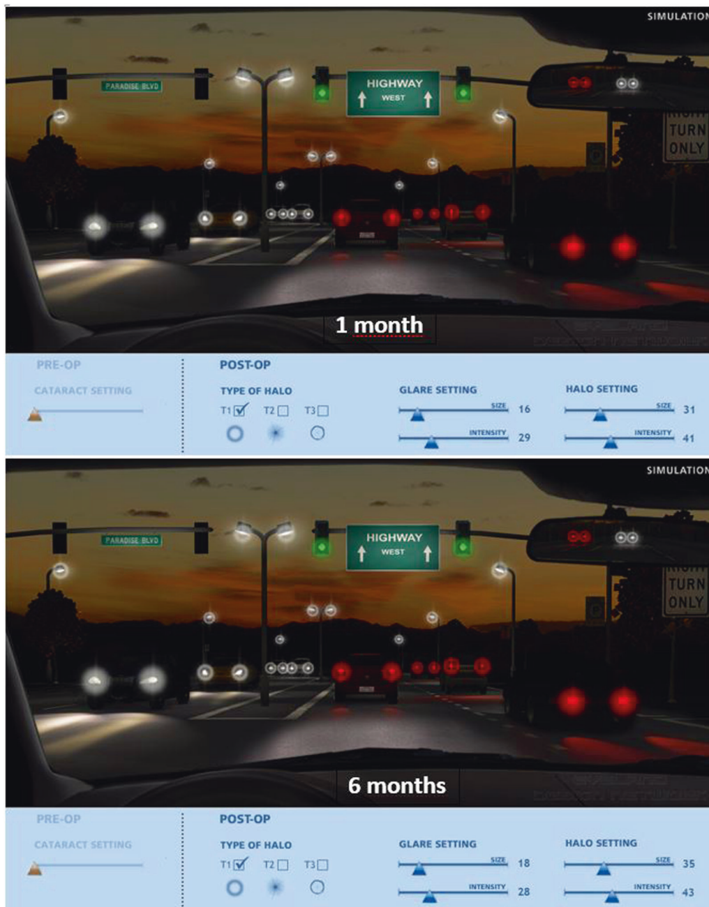
Fig. 2 Average simulation of glare and halos at 1 and 6 months after surgery

Halo intensity was scaled at 41 (1 month) and 43 at 6 months. Glare size was smaller (16 for 1 month and 18 at 6 months) and intensity was scaled at 29 at 1 month and 28 at 6 months. Overall, there were no statistically significant differences in the parameters evaluated between the 1-month and 6-month postoperative visits ( p > 0.05 ).