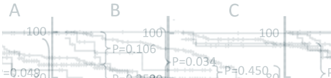
Figure 2 Kaplan-Meier survival curves for the three categories of patients. (A) Disease-specific survival (DSS) curves. The 5-year DSS of the low- and intermediate-risk patients was better than that of the high-risk patients ( P < 0.001 and P < 0.005 , respectively). There was a trend of better 5-year DSS in the low-risk patients, compared with the intermediate-risk patients ( P = 0.049 ); (B) Local recurrence-free survival (RFS) curves. No statistical difference in 5-year RFS was seen among the three categories of patients. But there was a trend of better 5-year RFS in the low-risk patients, compared with the intermediate-risk patients ( P = 0.034 ); (C) Distant metastasis-free survival (MFS) curves. Statistical difference was not achieved in 5-year MFS among the three categories.

2DCRT, 2-dimensional conventional radiotherapy; IMRT, intensity-modulated radiation therapy; OS, overall survival; DSS, disease-specific survival; RFS, local recurrence-free survival; MFS, distant metastasis-free survival.