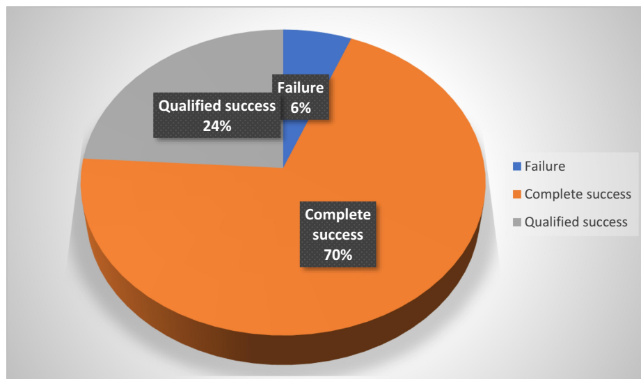
Figure 2 Pie chart showing distribution of the studied patients according to success.

rate of surgery in PCG patients with a corneal diameter greater than 14 mm.