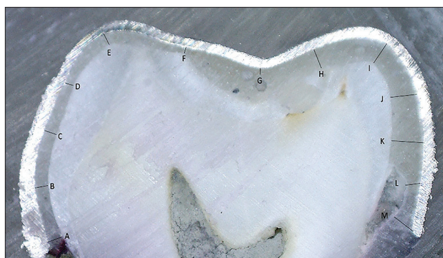
Figure 1: Buccolingual section showing the measurement sites (A-M) on a stainless steel crown cemented with resin cement.

Thirteen measurements were made at 13 different sites on the digital photographs of the sectioned surfaces of the specimens using a modified method to that adopted by Korkut et al. [14] The measurement sites were selected as follows: (1) buccal and lingual finishing points of the crowns, (2) buccal and lingual cusp tips, (3) deepest point of the occlusal surface, (4) buccal and lingual midpoints between the cusp tip and the finishing points, and (5) another location exactly in-between the initial ones [Figure 1]. In each measurement, the perpendicular distance between the tooth structure and internal surface of each crown was measured digitally by employing computer