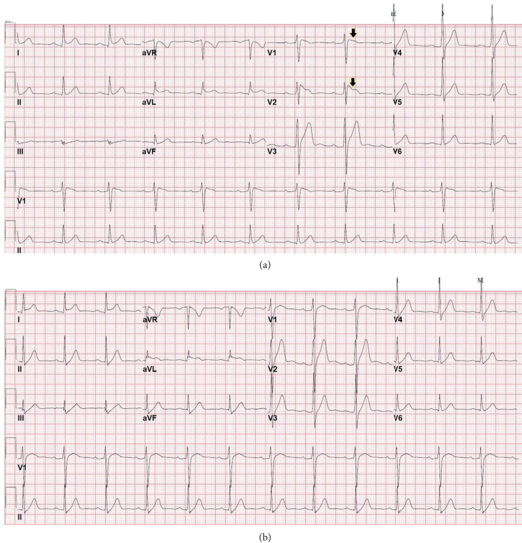
FIGURE 2: Electrocardiograms revealing recurrence of the Brugada pattern in the setting of recreational drug use (a, arrow) and complete resolution after approximately 24 hours without substance use (b).

coronary events, pericarditis, myocarditis, pulmonary embolism, metabolic disorders, electrolyte imbalances, dissecting aorta aneurysm, thiamine deficiency, electric shock, certain pharmacologic agents, left ventricular hypertrophy, athlete's heart, right bundle branch block, pectus excavatum, septal hypertrophy, arrhythmogenic right ventricular cardiomyopathy or dysplasia, autonomic nervous system abnormalities, Duchenne dystrophy, Friedreich's ataxia, mediastinal tumor, and Chagas disease [7, 10].