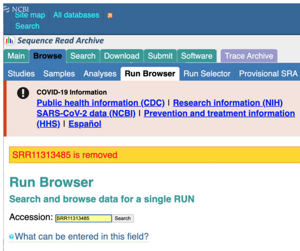
FIG. 1. Accessions from deep sequencing project PRJNA612766 have been removed from the SRA. Shown is the result of searching for “SRR11313485” in the SRA search toolbar. This result has been digitally archived on the Wayback Machine at https://web.archive.org/web/20210502131630/https://trace.ncbi.nlm.nih.gov/Traces/sra/?run=SRR11313485 .