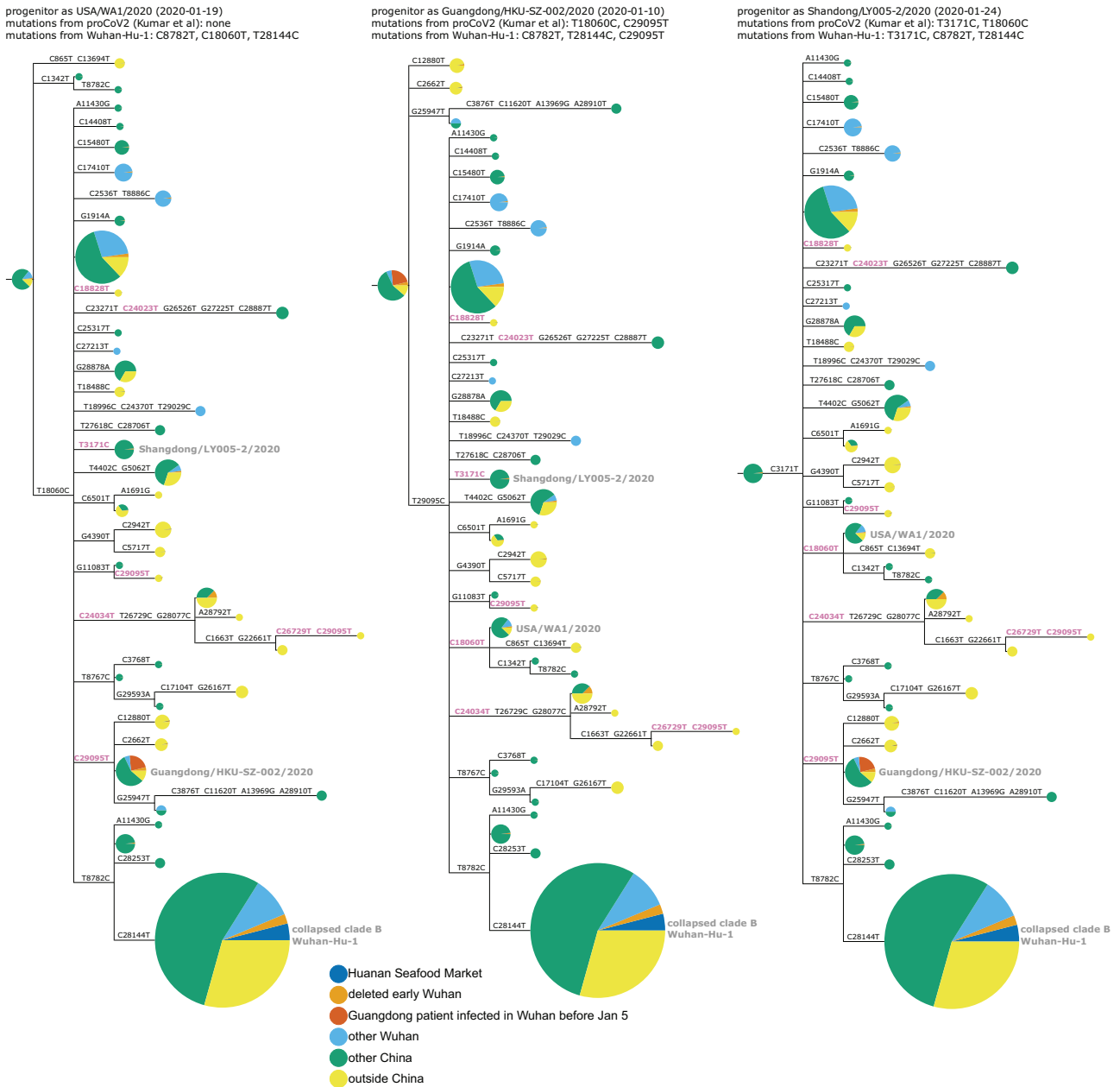
Fig. 5. Phylogenetic trees like those in fig. 3 with the addition of the early Wuhan epidemic sequences from the deleted data set, and Guangdong patients infected in Wuhan prior to January 5 annotated separately. Because the deleted sequences are partial, they cannot all be placed unambiguously on the tree. Therefore, they are added to each compatible node proportional to the number of sequences already in that node. The deleted sequences with C28144T (clade B) or C29095T (putative progenitor in middle tree) can be placed relatively unambiguously as defining mutations occur in the sequenced region, but those that lack either of these mutations are compatible with a large number of nodes including the proCoV2 putative progenitor. Supplementary figs. S4 and S5, Supplementary Material online, demonstrate that the results are identical if RpYN06 or RmYN02 is instead used as the outgroup.

plausible identities for the progenitor of all known SARS-CoV-2. One is proCoV2 described by Kumar et al. (2021) , and the other is a sequence that carries three mutations (C8782T, T28144C, and C29095T) relative to Wuhan-Hu-1. Crucially, both putative progenitors are three mutations closer to SARS-CoV-2's bat coronavirus relatives than sequences from the Huanan Seafood Market. Note also that the progenitor of all known SARS-CoV-2 sequences could still be downstream of the sequence that infected patient zero—