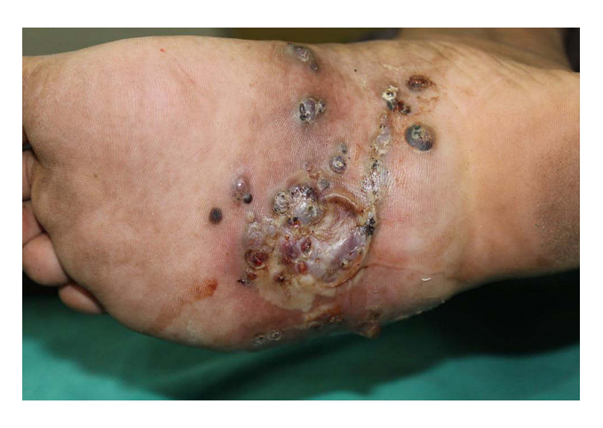
Figure 1 Classic triad of mycetoma with woody hard swelling, discharging sinuses and grains.

As the mycetoma involves mainly the skin and the subcutaneous tissue, the presentation is usually the classical triad of a painless, indurated subcutaneous mass giving a woody hard feel, multiple discharging sinuses, and presence of grains in the purulent or seropurulent discharge<sup>6</sup>