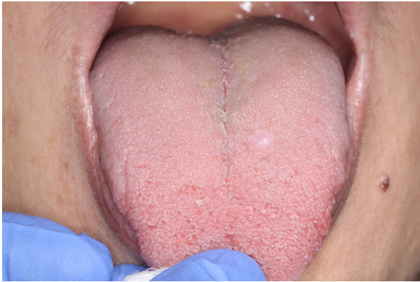
Figure 1. Dorsal surface of tongue showing the lesion at presentation – a small swelling just left of the midline.

nonencapsulated, but circumscribed mass covered by stratified squamous epithelium (Fig. 2A). Centrally, lobules of fibromyxoid stroma separated by fibrous septae were seen. Within these lobules were numerous randomly distributed stellate and spindle-shaped cells. Nuclear pleomorphism was not marked and mitotic figures were not conspicuous (Fig. 2B). Lesional cells showed positive immunoreactivity with S100 (Fig. 2C) and vimentin, but were negative for CD34. At these levels, excision appeared complete. A diagnosis of a NSM was established. The patient was reviewed 18 months later with no evidence of recurrence (Fig. 3).