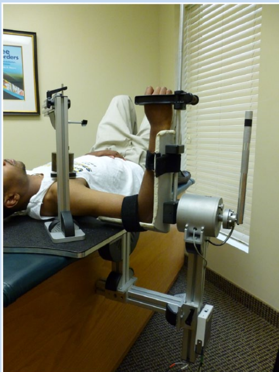
Figure 1. Shoulder rotation device with an integrated backboard, arm cradle, and scapular stabilization.

causes fibrotic changes in the capsulo-ligamentous structures of the shoulder. These fibrotic changes may serve to maintain the overall stability of the joint by decreasing capsular distensibility posteriorly but concomitantly preventing full IR. The etiologies of this decreased IR include posterior capsular tightness, 5-7 osseous adaptation, 3,10,26 and muscular tightness. 3,33