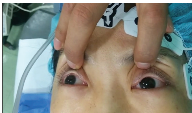
Figure 2: Doll's eye examination (vestibulo-ocular reflex), light reflex: No specific abnormality

Laboratory tests and brain magnetic resonance imaging performed to rule out organic causes of the patient's symptoms revealed normal findings. Even after transfer to the sub-ICU, the patient continued to show myoclonus in the upper limbs that occurred three to four times per hour as well as rigidity in the lower limbs. On postoperative day (POD) 1, the myoclonus in the upper limbs occurred one to two times per hour, and the patient was able to walk with the help of a caregiver. The aphasia was improved to the degree of enabling communication. The patient described her previous state as "being conscious and able to hear voices, but unable to move her body as she wanted." On POD 2, the myoclonus in the upper limbs and the rigidity in the lower limbs had almost completely resolved, and the patient was able to walk on her own. On POD 3, the patient was discharged with no particular