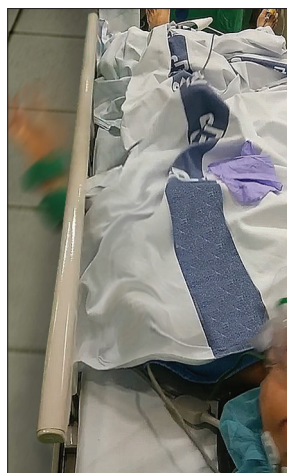
Figure 1: Upper-limb myoclonus, lower limb rigidity

Upon arrival in the recovery room, the patient complained of pain at a level of 8 on the numeric rating scale, and fentanyl 100 mcg was administered intravenously. Three minutes after the fentanyl administration, the patient developed intense and uncontrolled myoclonus in both arms at a rate of three to four times per second as well as rigidity in both lower limbs [Figure 1] [Video Available on]. The patient's mental status was agitated. The patient also displayed periorbital swelling, facial flushing, and neck swelling as well as aphasia. The pupil diameter was 3–4 mm, and the light reflex was normal. Vital signs were as follows: blood pressure 100/42 mmHg, heart rate 90/min, respiratory rate 30/min, body temperature 36.7°C, and SaO 2 98% with face mask with reservoir bag 10 L. As opioid-induced myoclonus and rigidity were suspected, IV administration of naloxone